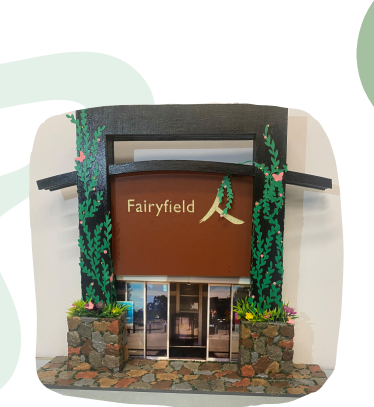
Hawaiians Guest Services